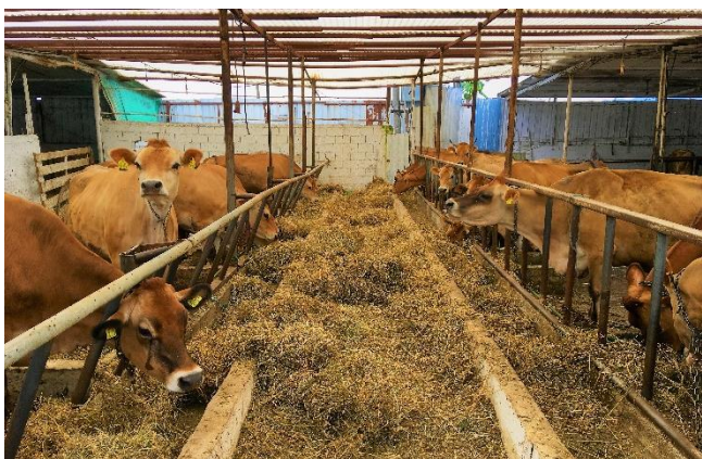
Brothers Bullari farm