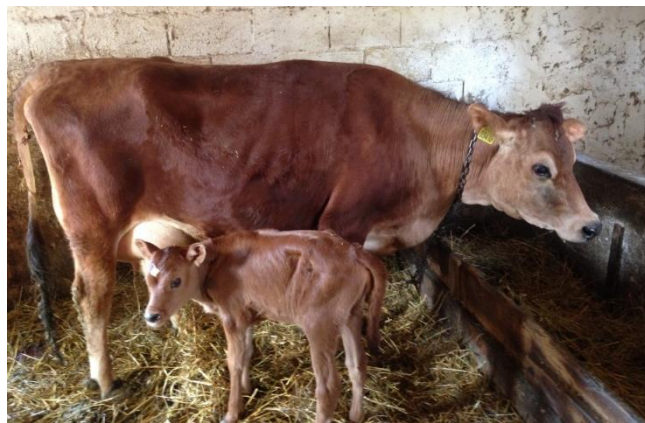
Donated heifer with calf

Price approx. 650 eur. per pers. in double room (single room approx. 120 eur. more)